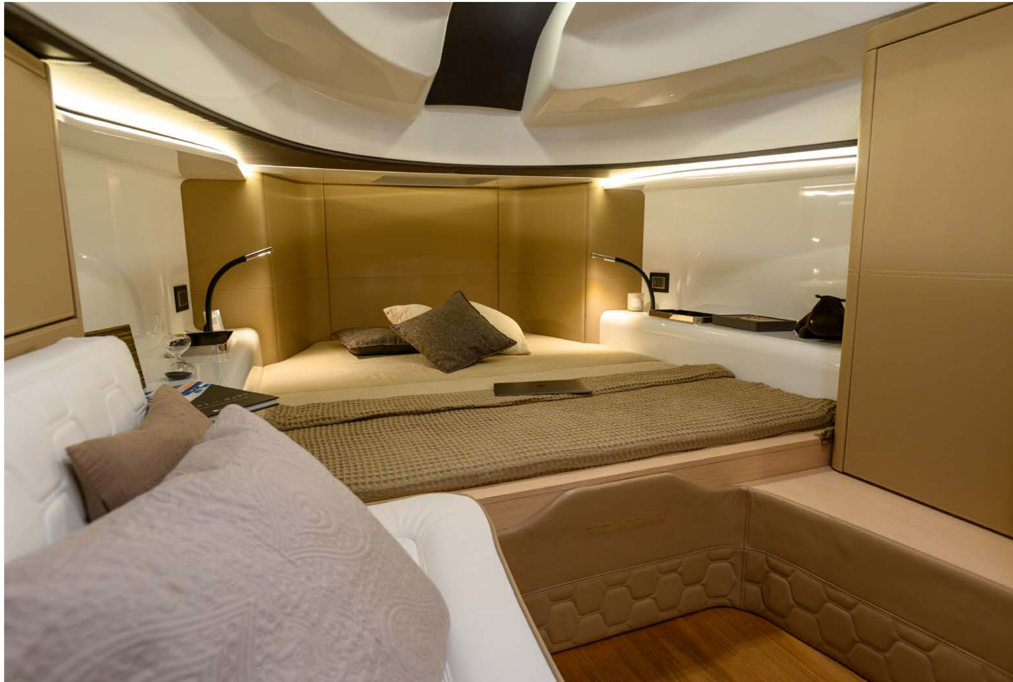
Bow master stateroom with livable spaces, sofa and super queen size bed