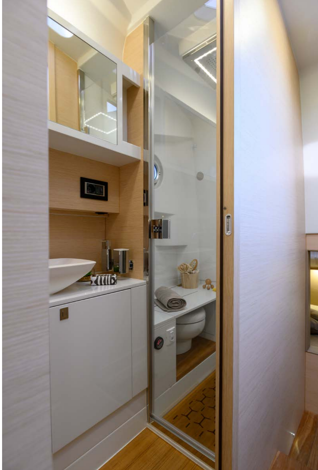
Bathroom area with separate rain shower and toilet